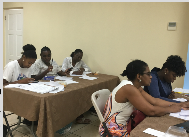
SGG Training 2019

This training program, while done on a small scale in Grenada, has been, for the past 4 years, an effective tool in empowering the services sectors of Grenada. Hence, the GCSI will continue in its effort to host this training annually.