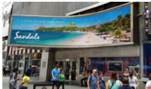
Times Square, New York City

We will utilise creative advertising including everything from billboards and TV commercials, to magazines and taxi cabs. In the coming months, our creative crew will be visiting to shoot commercials and photographs that will help to sell the resort and the destination.